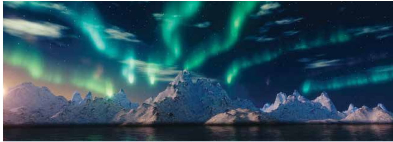
Some legends say the lights are powerful spirits.

Vikings feared and celebrated the Northern Lights. Some Vikings believed the lights were the armour of female warriors. Others believed the lights were reflections of their gods.