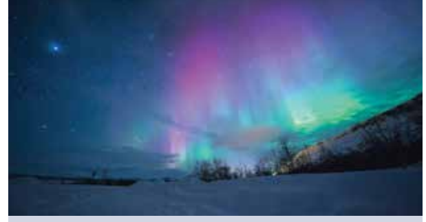
These are the Northern Lights.

In Northern BC, you might see these beautiful lights in the sky between December and April. The lights are so bright that they can be seen from outer space.