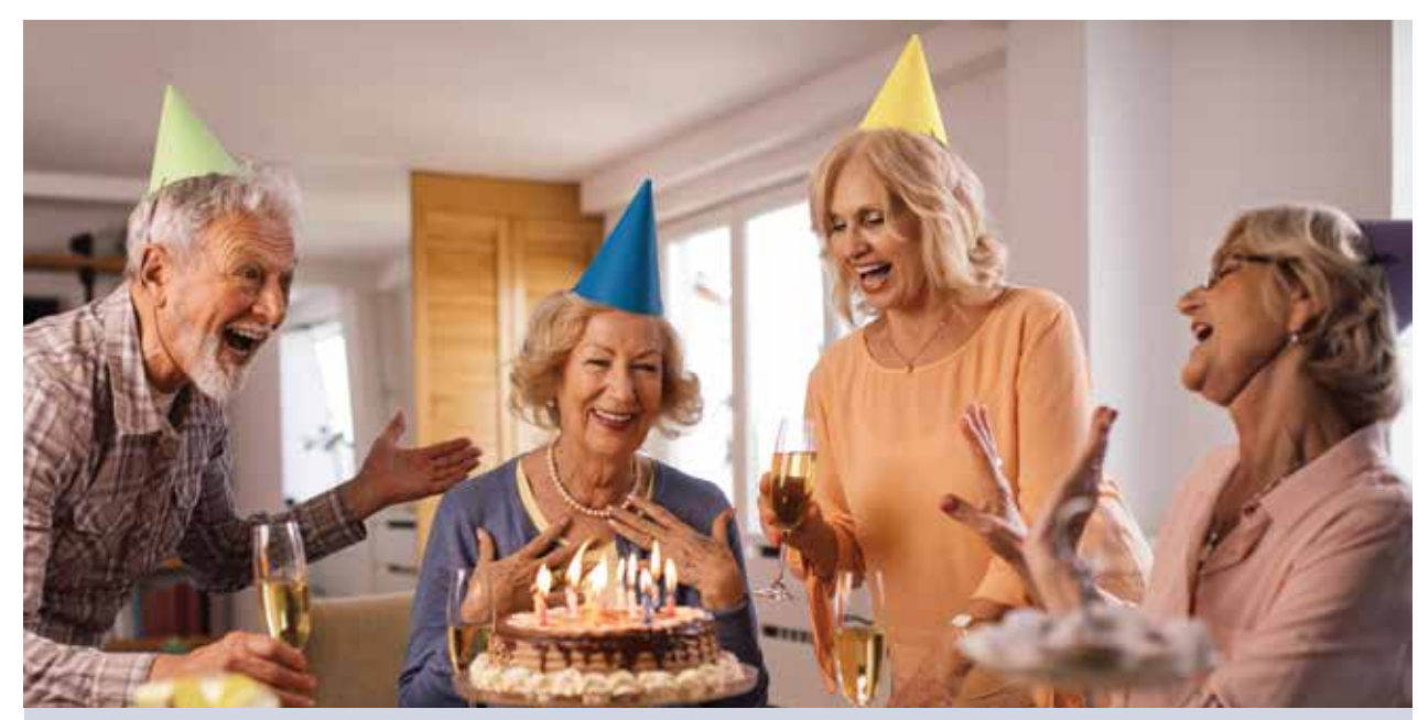
These people are singing "Happy Birthday to You."

The sisters said it was their song. If people used the song to make money, they had to pay a fee. In 2016, a court ruled that the song was free to use.