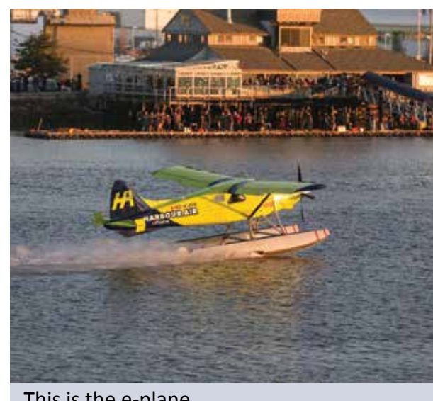
This is the e-plane.

The seaplane made history on December 10, 2019. It flew for three minutes in a test flight over Richmond, BC.