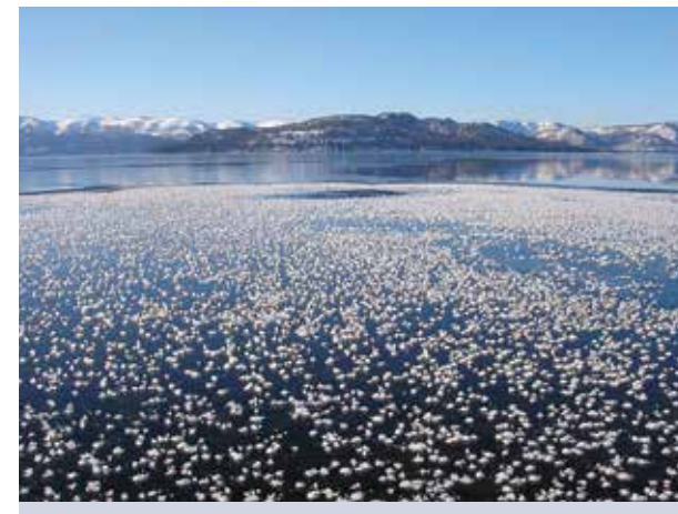
These are frost flowers

The flowers are made of ice. They are called "frost flowers."