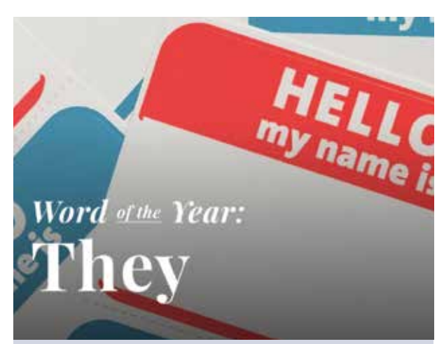
"They" is word of the year for 2019.