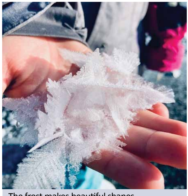
The frost makes beautiful shapes.

Adapted from Global News