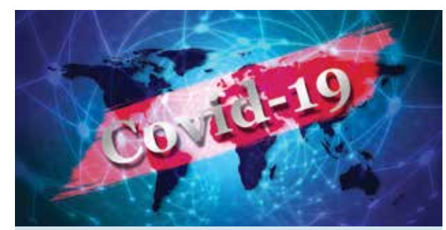
COVID-19 is a new virus.

The COVID-19 outbreak first appeared in Wuhan, China in December 2019.