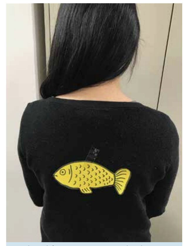
April Fools' Day was once April Fish Day.

At this festival, people dressed in disguise to trick or fool others.