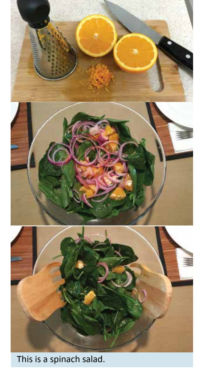
5. Add the oil, sugar, salt, pepper and and the orange peel to the cup. Stir in

4. Grate the peel of one orange. Squeeze the juice of the orange into a cup.