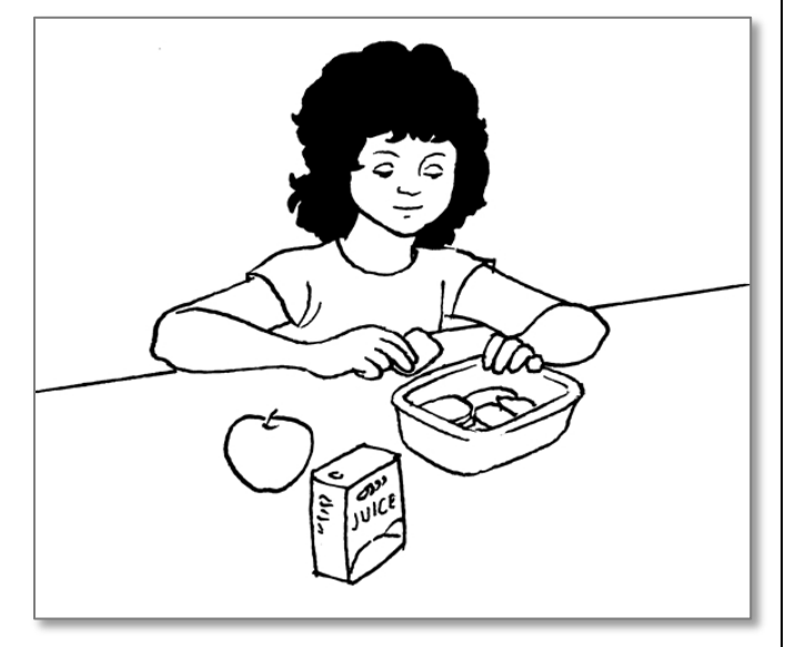
An 8-year-old can make a lunch for school.