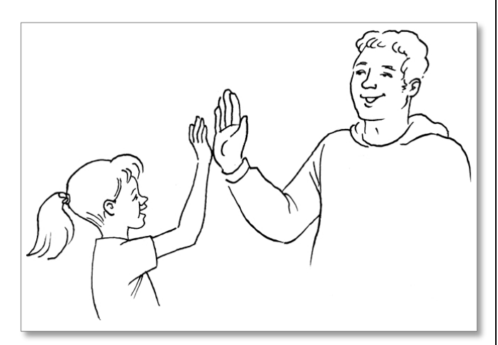
Praise children for finishing a chore and for doing a good job.

Show children how to do a chore. Later, they can do it without your help.