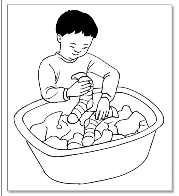
A 3-year-old can match socks in the laundry basket.