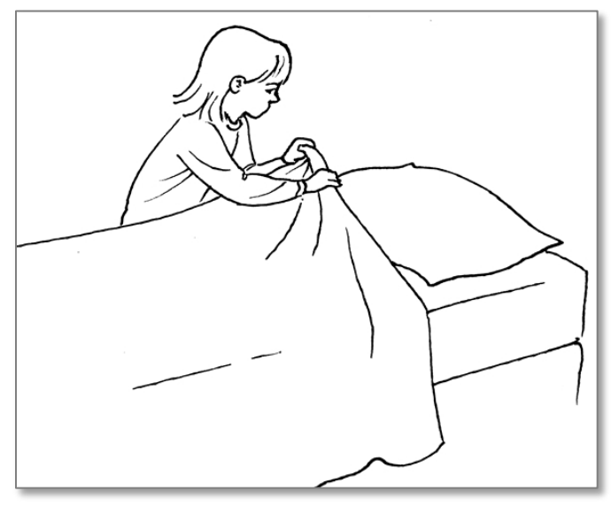
A 5-year-old can make a bed by pulling up the comforter.