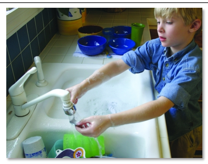
A boy washing dishes