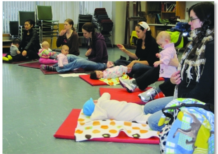
Mothers and babies learn to sign