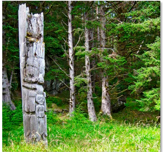
Grave yard totem in Gwaii Haanas at the UNESCO World Heritage Site