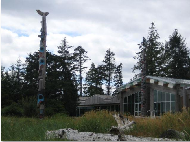
This totem pole is in front of the Haida Heritage Centre.

The Haida community is proud of their new pole.