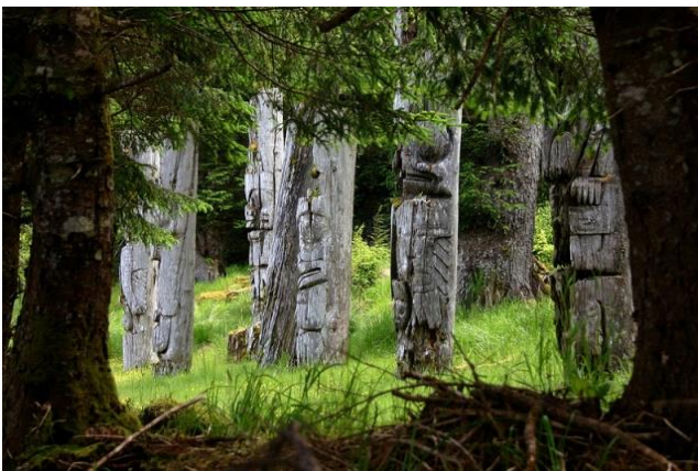
Old totems in Gwaii Haanas