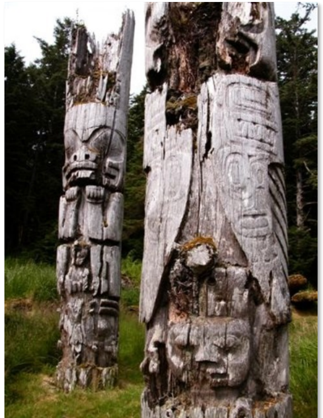
Gwaii Haanas National Park, Queen Charlotte Islands, BC