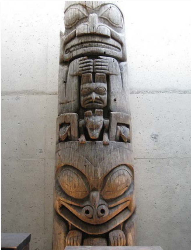
This is a Haida totem pole.