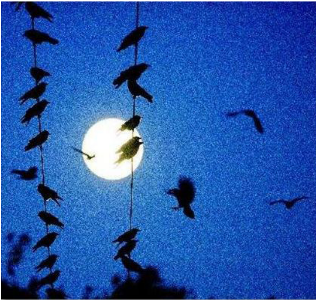
Crows gather on the wires at dusk.