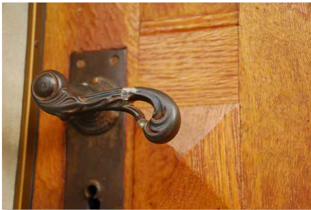
Beautiful old lever door handle