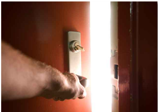
Push the door handle to open the door.

You push the new levers down to open a door.