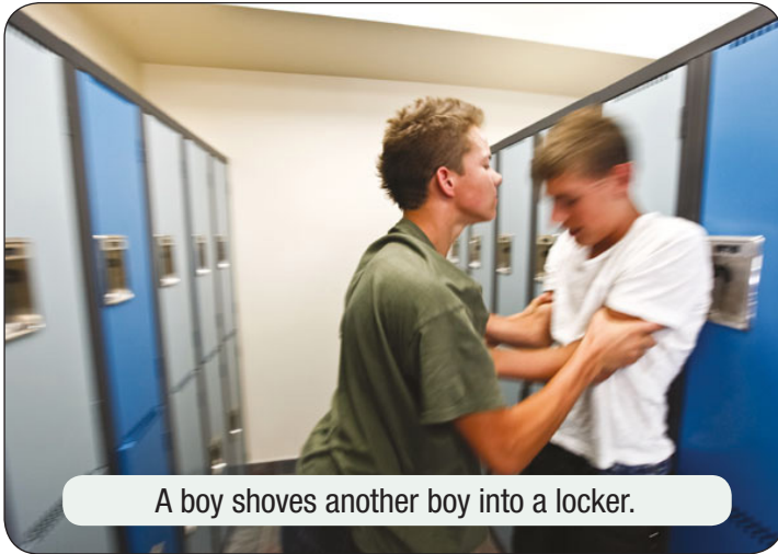
A boy shoves another boy into a locker.