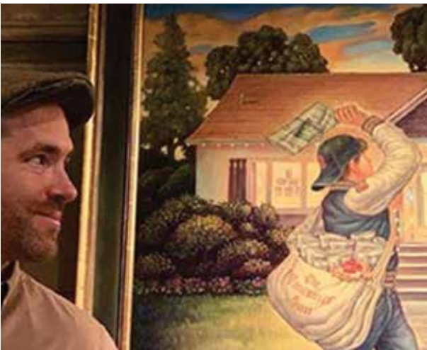
This is a painting of Ryan Reynolds.

In the painting, Ryan is delivering The Vancouver Sun to a house. The house is where Ryan grew up in Vancouver.