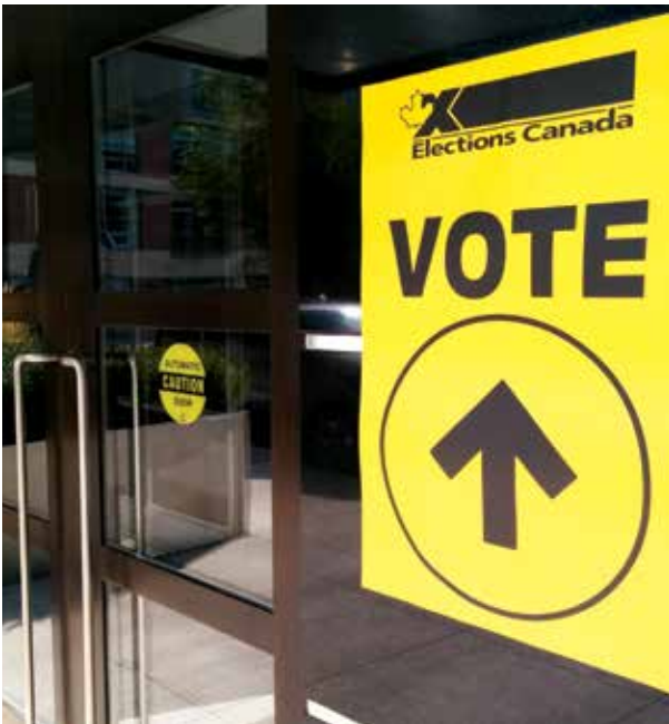
This is a polling station.