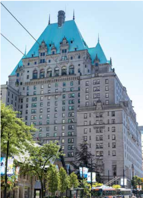
This is the Fairmont Hotel.