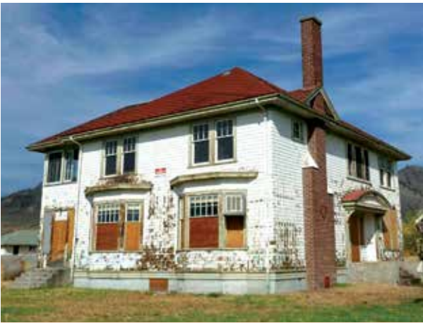
This is an old building at the Tranquille Sanatorium.

In 1907, a place was built to treat people with tuberculosis. The children stayed on the 8 floor. The place closed in 1958. Today, people say they still hear children crying on the 8 floor.