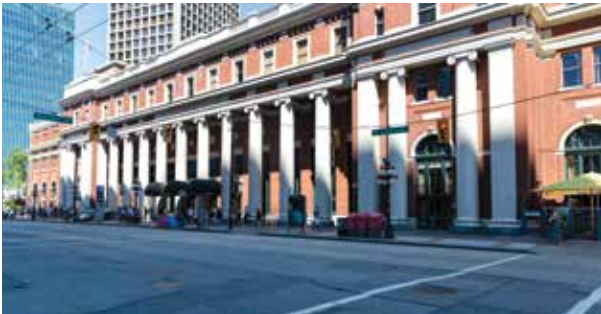
This is Waterfront Station.

The train station is called “the most haunted building in Vancouver.” A security guard says he saw the ghost of a woman dancing by herself. She was wearing clothes from the 1920s. People say they have seen the ghosts of three old women. They say the three ghosts sit on a bench waiting for the train.