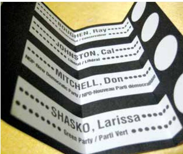
This is a ballot.