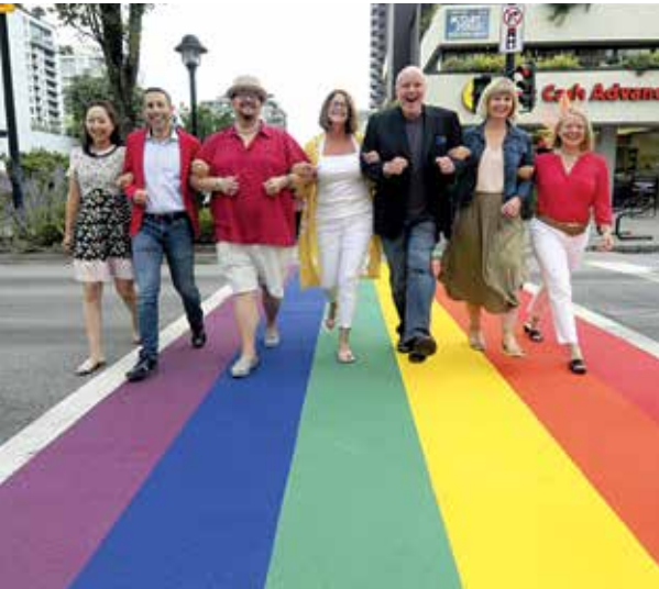
This is the rainbow crosswalk in North Vancouver.

Adapted from City of North Vancouver News Release • Photo: City of North Vancouver