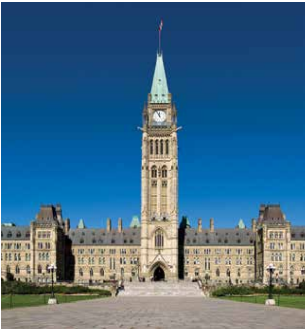
This is Parliament Hill in Ottawa.