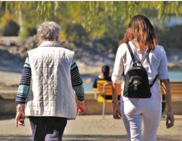
This is a senior and a young woman.