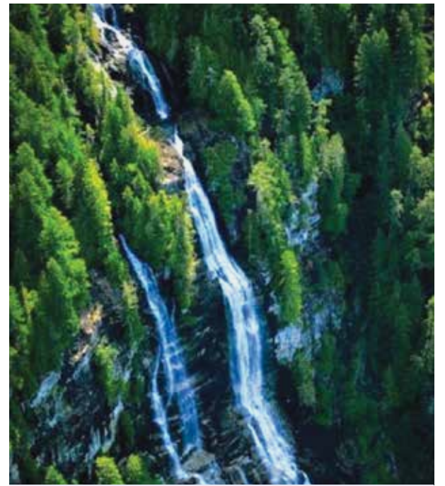
This is Skookumchuck Rapids.

Skookumchuck Park is near Sechelt on the Sunshine Coast.