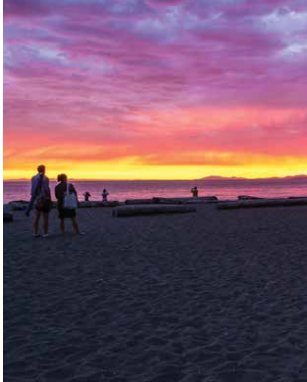
This is Wreck Beach.

Wreck Beach is the largest nude beach in Canada. It is 7.8 km long.