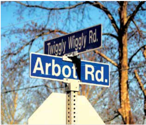
This is Twiggly Wiggly Road.

Adapted from CBC News and Cottage Life