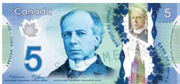
This is a $5 bill.