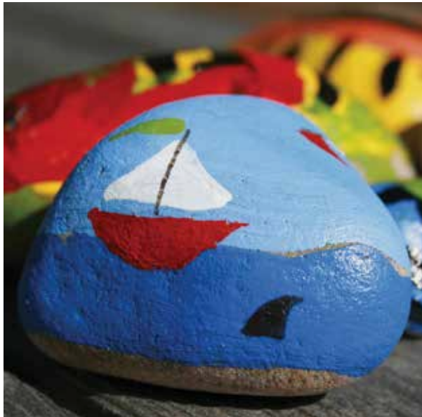
You can paint many designs on rocks.