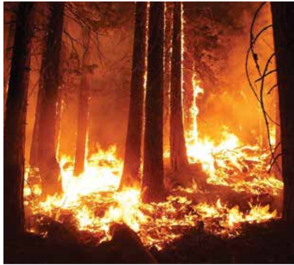
This is a wildfire.

Adapted from CBC News and Canadian Interagency Forest Fire Centre Inc.