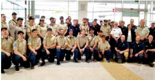
These Canadian firefighters are helping Australia.

Some of the firefighters are from BC. In 2017 and 2018, Australian firefighters helped BC during its wildfires.