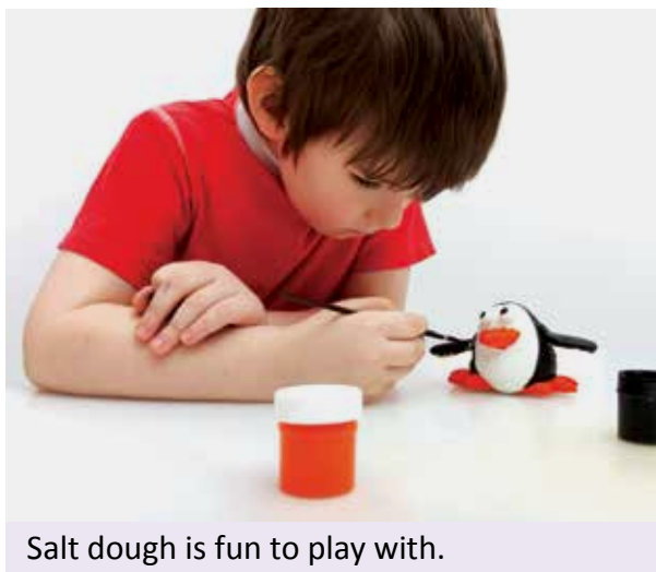
Salt dough is fun to play with.