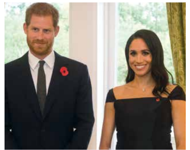
This is Prince Harry and Meghan Markle.

"We now plan to balance our time between the United Kingdom and North America," said Prince Harry.