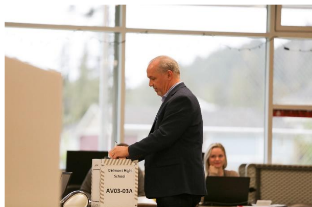
Premier John Horgan voting in the 2017 election.

Adapted from Elections BC •