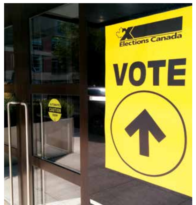
This is a polling station.