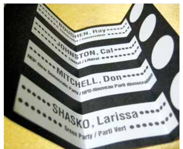
This is a ballot.