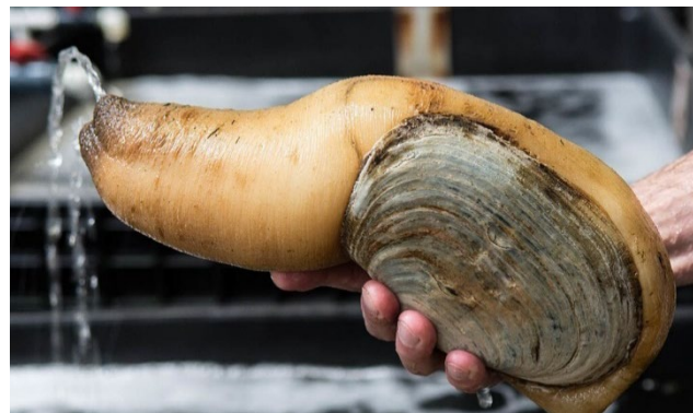
This is a geoduck clam.

Adapted from BC Local News •