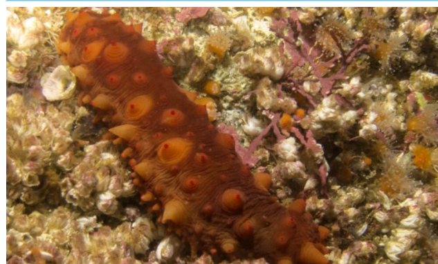
This is a sea cucumber.